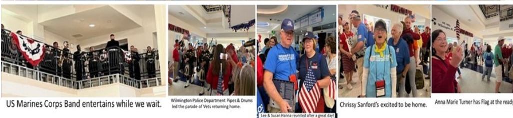
US Marines Corps Band entertains while we wait.