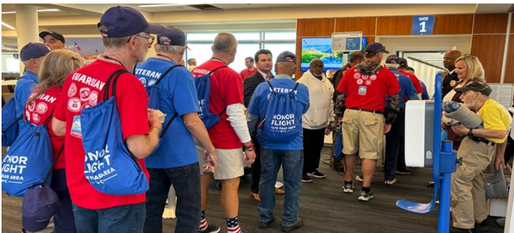
2024 Honor Flight of Cape Fear Area participants on their way to Washington, D.C