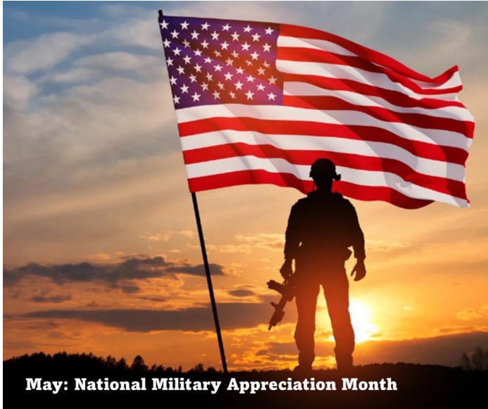
May: National Military Appreciation Month

National Military Appreciation Month, the month of May, is a month-long observance honoring the sacrifices of the United States Armed Forces. Today, the United States Armed Forces is comprised of six branches including the Army, Navy, Air Force, Marines, Coast Guard, and Space Force. The U.S. military force is 2.2 million strong and includes National Guard and Reserve units. (Source: https://www.nationaldaycalendar.com/may/national-military-appreciation-month#:~:text=During%20May%2C%20we%20recognize%20Loyalty,members%2C%20and%20veteran%20service%20members ).