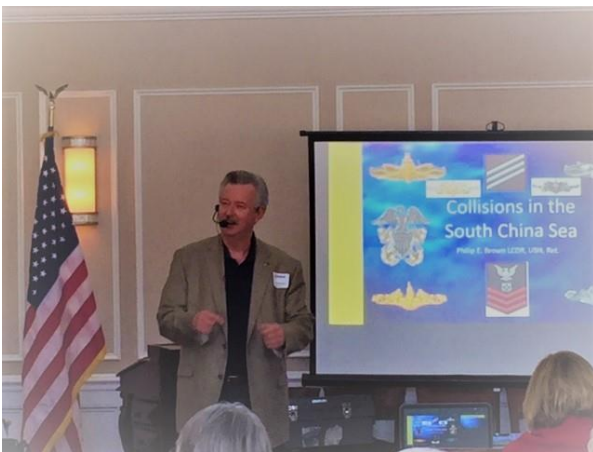
February Presentation on 7 th Fleet Collisions

One last note: Please mark your fall calendars and save the date Oct. 19, 2018. SENCLAND will host the NC Council of Chapters Quarterly Meeting. We have reserved the Wardroom on the Battleship North Carolina for an evening event to include reception, tour, dinner and guest speaker for approximately 120 MOAA members. We estimate 40-50 representatives from other MOAA Chapters in North Carolina, plus NCCOC State officers who will be attending and staying at the Embassy Suites next to the Convention Center. Since the quarterly meeting will also be our October monthly SENCLAND meeting, we will be limited to about 80 of our membership for the dinner on the battleship. There will be RSVP information before our summer recess. Please mark your calendar and plan to attend at a perfect time of year on the water in Wilmington.