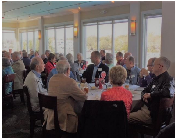
Near-record Attendance in February